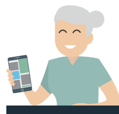
S.U.R.E. for Life