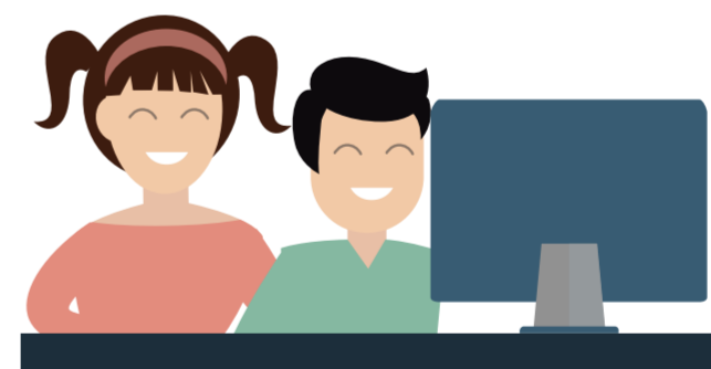
S.U.R.E. for School

S.U.R.E. for Life aims to educate the general public on the threats that deliberate online falsehoods pose to the peace and stability of society.