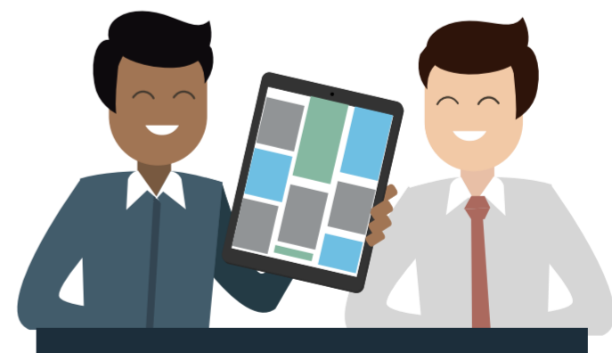
S.U.R.E. for Work